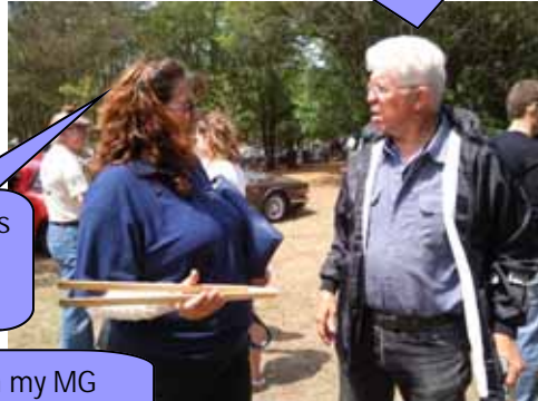
Yes! It Braai's meat too!