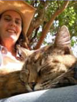
What the Lady and the Cat saw !