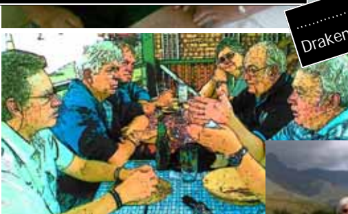
.....and the fun times we had in Graskop and the Drakensberg in between.....