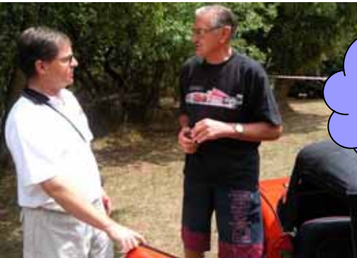
We are the Champions the Studebakers!