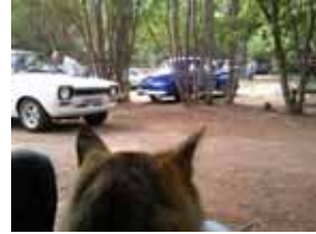
A blue one ! And a green one! And an old one! And a yellow one! And a yellow and Red one!