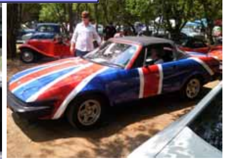
A Gagggle of Geese; A Flock of Birds; A Herd of Elephants; A Litter of Pups; A Bevy of Beauties; And a Parking of Triumphs!